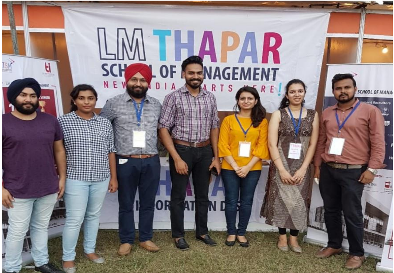
Student Marketing team represented LM Thapar School of Management in Zaika, the cultural cum food festival is being organized in Patiala, is a 2-day extravaganza and is scheduled to be organized on 8th & 9th September 2018